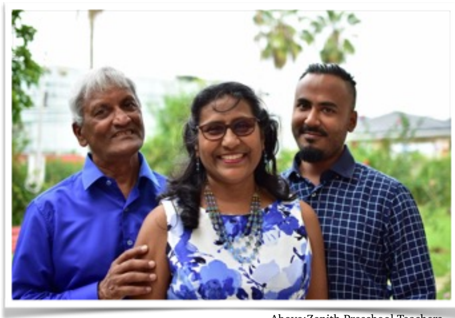
Above: Zenith Preschool Teachers